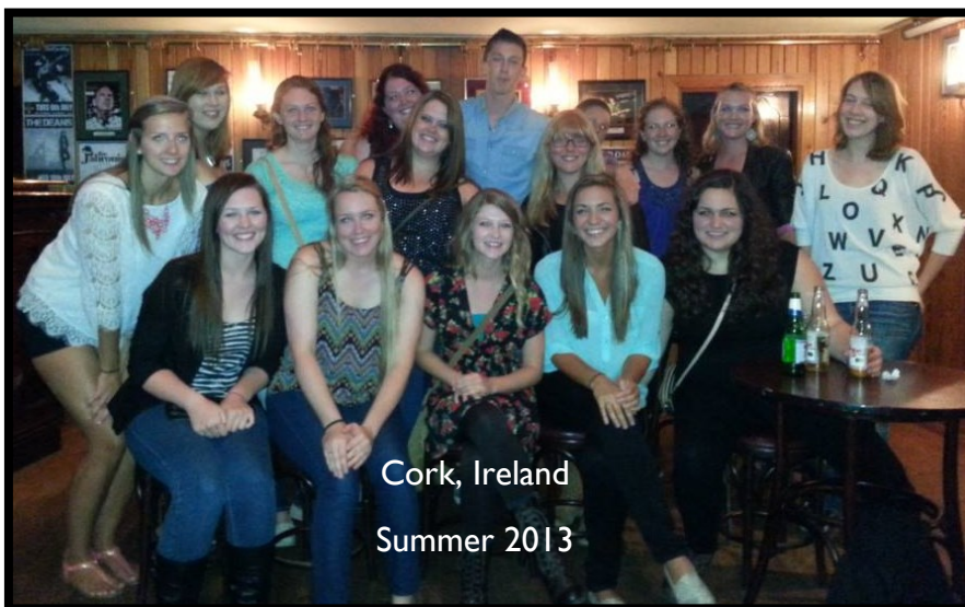
Cork, Ireland Summer 2013